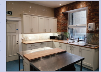
New Kitchen at Mullartown

Please pray for each of the camps as they roll round - the programme directors, teams of leaders, cooks, campers and the homes they come from that they would experience God in a life changing way.