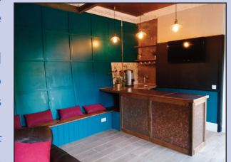
Coffee Dock at Mullartown