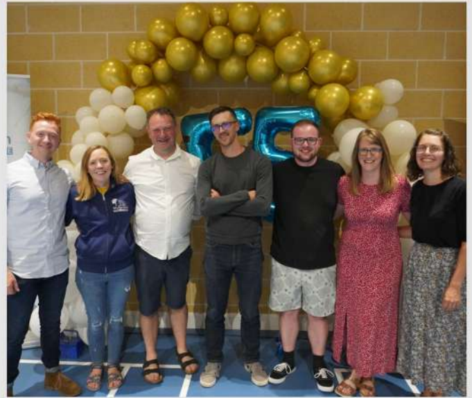
BCM NI STAFF 2023

It is a bitter-sweet season of ending my time here in Northern Ireland in November. It has been such a privilege to serve alongside the wonderful staff of BCM and with all the gracious volunteers for the past two years! My husband and I are moving to Canada (his homeland), doing a documentary in Europe en-route first before landing for the next two years. We are forever grateful to God for letting us be a part of this ministry in this wonderful place. Thank you for welcoming us!